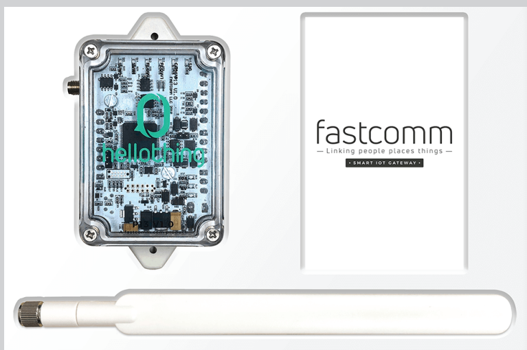
(Gateway for cuber ice machines)