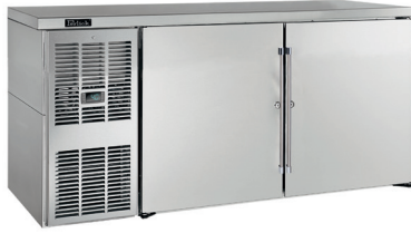
BBSLP60 with stainless steel door shown