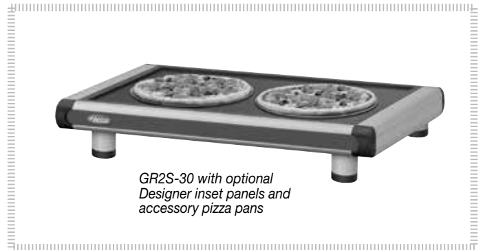
GR2S-30 with optional Designer inset panels and accessory pizza pans