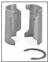
Aluminum Split Sleeve