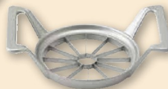
43796 • Apple Corer AL/SS, 6 1/2" x 4 1/2" (cd)