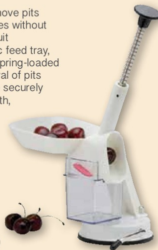
43681 • Deluxe Cherry Pitter PL, 11" x 7 1/2" x 4 1/2" (bx)