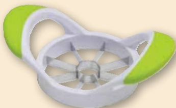
48020 • Apple Corer SS Blades/Silicone Handles, 7" x 4" (cd)