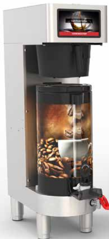
Model PBC-1V vacuum Shuttles and graphics sold separately