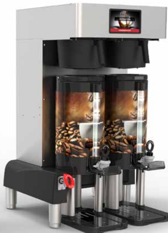
Model PBC-2VS vacuum Shuttles and graphics sold separately