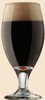
Beer No. 3915 ■ 14¾ oz./43.6 cl./436 ml.

Featuring elegant yet robust designs, use Libbey Stemware to elevate your presentation of ales and lagers and increase profit per serving.