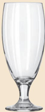
Pilsner No. 3804 ■ 16 oz./47.4 cl./473 ml.

American Amber Lager Pilsener Dortmunder American Lager Fruit Beer