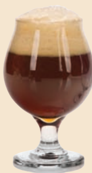
Belgian Beer No. 3808 ● 16 oz./47.3 cl./473 ml.

Russian Imperial Stout Barley Wine Abbey Dubbel Abbey Tripel & Strong Golden Ale Hyper-Beers