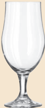
Munique Beer No. 920284 ✖ 🌀 16½ oz./49.0 cl./490 ml.

Ideal for presenting Lambic and Saison, the elegant tulip shape of Munique is also very well-suited for specialty fruit beers.