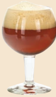
Abbey Goblet No. 921465 ● 20 oz./60.0 cl./600 ml.

American Amber Lager Pilsener Dortmunder American Lager Fruit Beer